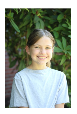
Age 11, 6th Grade Glendale Lutheran School